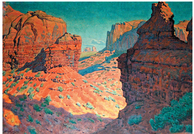
Monument Valley. Watercolor.