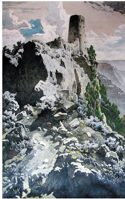
Desert View Watchtower. Handcolored photographic print.