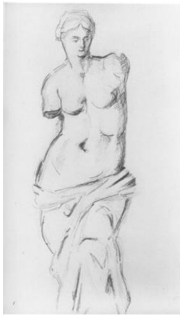
Fig. 14 Paul Cézanne, After Venus de Milo , 1872-73, Pencil on paper, 21.8 x 12.4cm, Private Collection, Paris