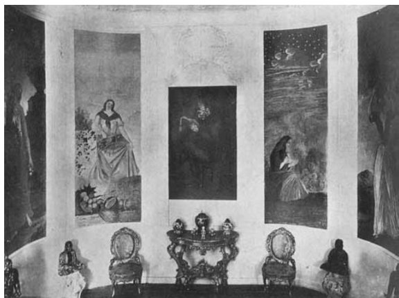
Fig.6 Big salon at the Jas de Bouffra, n.d, photographer unknown

The Four Seasons is a classic theme in Western art, taken up by such painters as Poussin, and in Cézanne's work more so than a Rococo style he demonstrates the elegant outlines, palette and smooth glossy matière of the school of Dominique Ingres (1780-1867). He included an Ingres signature in the composition, with the date 1811 written on the Winter image. The Musée Granet collection includes a work, Jupiter and Thetis (fig. 7), in Aix that is signed "Ingres" and "1811." Thus Cézanne imitated the great neoclassical painter Ingres and sought to appeal to his father by demonstrating that he had the talents of an orthodox painter. Prior to creating his Four Seasons , Cézanne's drawing from 1858-60 is a copy of Ingres' Jupiter and Thetis (fig. 8). But this was a caricature, not a faithful copy, given the changes he made in the figures' poses and actions. The subject is taken from the Iliad , and shows the scene where the goddess of water Thetis made a heartfelt plea to Zeus, the king of the gods, so that her son Achilles then at war, would be victorious. Cézanne changed the pose of the two figures, reading into Ingres' image the latent concept of "woman sexually tempting man." In the drawing Zeus, clasped at the neck by Thetis, looks down, uniting the two figures. Through his own personal interpretation of the Ingres painting Cézanne sought to surpass Ingres.