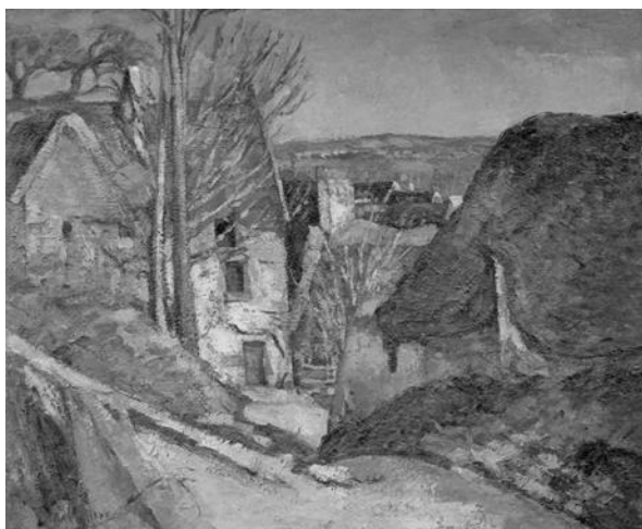
Fig.11 Paul Cézanne, La Maison du pendu, Auvers-sur-Oise , c. 1873, Oil on canvas, 55 x 66cm, Museum Orsay, exhibited at the first impressionism exhibition in 1874