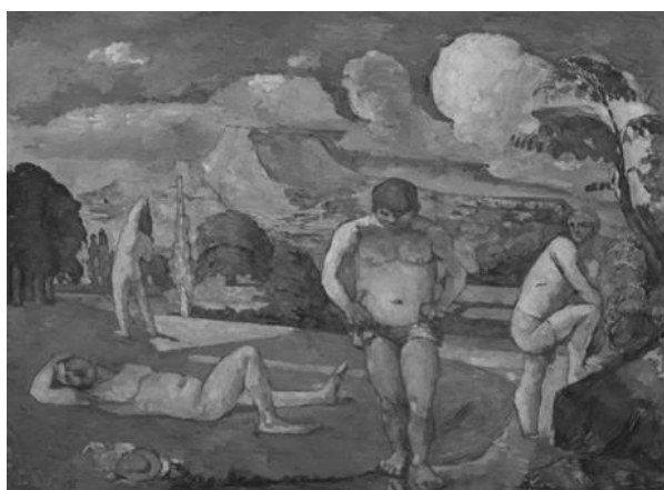
Fig.12 Paul Cézanne, Les baigneurs au repos , c. 1876-77, Oil on canvas, 79 x 97cm, Barnes Foundation, Philadelphia (formerly Merion), exhibited at the third impressionism exhibition in 1877

creation of paintings from his Impressionist period onwards Cézanne, unlike his colleagues, loathed the dismembering of the subject through light and shadow and dissolving it amidst atmosphere, turning instead to his own individual path, favoring firm forms, a sense of weight, and clearly defined depth (fig. 11).