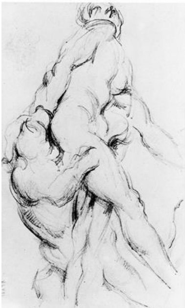
Fig.9 Paul Cézanne, After Puget, Milo of Crotona , 1882-85, Pencil on paper, 19.4 x 11.8cm, Private collection, Paris,

Cézanne's repeated copying of sculptures was underscored by his strong interest in three dimensionality, light and shadow, sense of mass and sense of movement. In fact, even in his