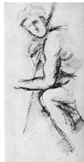
Fig. 16 Paul Cézanne, After Poussin: Et in Arcadia ego (Les Bergers d'Arcadie) , 1887, Pencil on paper, 20.9 x 12.2cm, Basel Museum

For Cézanne, born and raised in Aix-en-Provence in southern France, classical literature was the cultural background of his own Mediterranean world. His copies of classical sculpture that spanned his entire career, from youth to old age, were both a