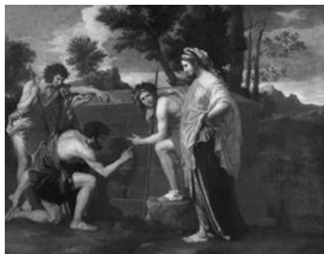
Fig.1 Nicolas Poussin, Et in Arcadia ego ( Les Bergers d'Arcadie ), late 1630s, oil on canvas, 85 x 121 cm, Louvre Museum