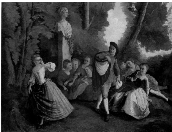
Fig.4 Paul Cézanne, After Lancret: Le Jeu de cache-cache , 1862–64, 165 x 218 cm, Nakata Museum, Onomichi City, Japan