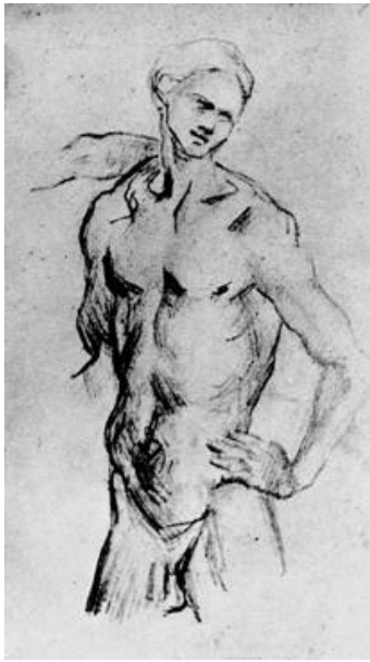
Fig. 13 Paul Cézanne, After Luca Signorelli: Male Nude , 1866-69, Pencil on paper, 24 x 17.8cm, Th. Werner, Berlin