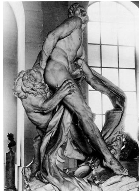
Fig.10 Pierre Puget (1620-94), Milo of Crotona , 1682, Marble, 270 x 140cm, Museum Louvre