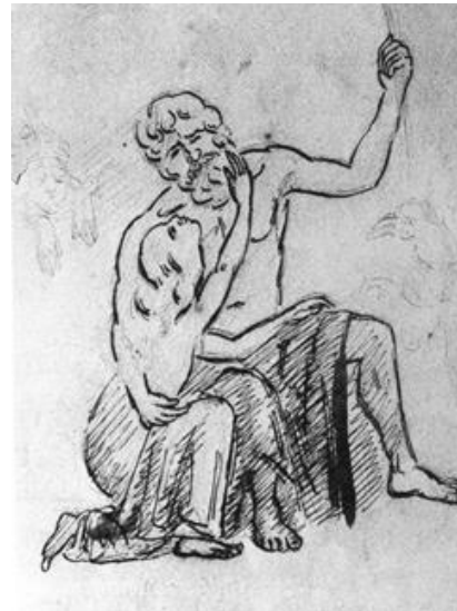
Fig.8 Paul Cézanne, After Ingres: Jupiter and Thetis , 1858-60, Pencil on paper, 23 x 15cm, Museum Louvre