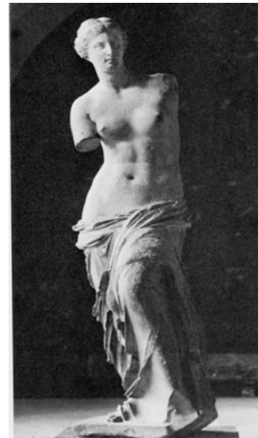
Fig. 15 Venus de Milo , BC.100, H.204cm, Marble, Museum Louvre

correcting the figure's inclined pose and making it vertical, and thus emphasizing its sense of presence. Cézanne's abbreviated depiction of her breasts erases the form's female nature, while he has also changed her head to a downward looking pose. Thus the copy drawing is not a faithful re-creation of the image but rather a changed form product. This drawing is reminiscent of the male figure in the middle of the Bathers (fig. 12). The male figure is dignified in form, with face inclined, left foot stepping forward and solid chest, and yet, the swelling to right and left of his chest retain traces of the fleshiness drawn in the copy drawing. In the Bathers series, it has been indicated[19] that many of the figures in the Bathers series are hermaphroditic in form, difficult to determine if they are male or female. And through this erasing of the male/female differentiation, it wouldn't be at all strange for Cézanne, with his interest in the universal figural form, to have transposed the image of Venus into that of a bather.