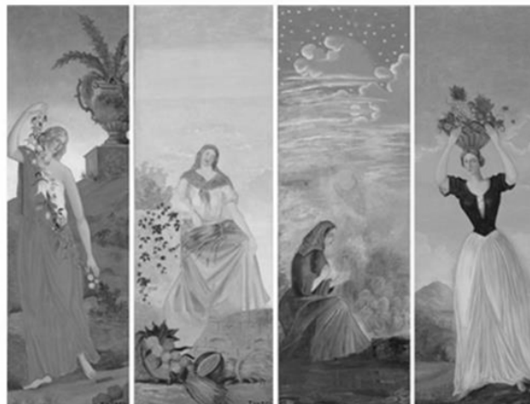
Fig.5 Paul Cézanne, Les Quatre Saisons: Le Printemps , 1860–61, Wall painting, detached and mounted on canvas, 314 x 97 cm, Musée de la Ville de Paris, Petit Palais/ Les Quatre Saisons: L'Été , 1860–61, Wall painting, detached and mounted on canvas, 314 x 109 cm, Musée de la Ville de Paris, Petit Palais/ Les Quatre Saisons: L'Hiver , 1860–61, Wall painting, detached and mounted on canvas, 314 x 104 cm, Musée de la Ville de Paris, Petit Palais/ Les Quatre Saisons: L'Automne , 1860–61, Wall painting, detached and mounted on canvas, 314 x 104 cm