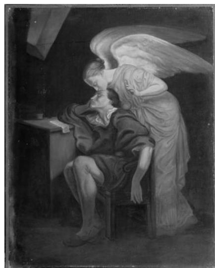
Fig.2 Paul Cézanne, After Frillié: Le Baiser de la muse , c. 1860, Oil on canvas, 82 x 66 cm, Musée Granet, Aix-en-Provence