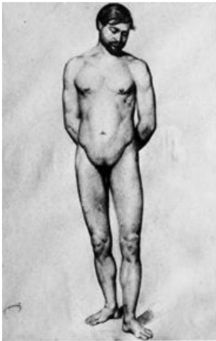
Fig.3 Paul Cézanne, Male Nude , 1862, Pencil on paper, 61 x 47cm, Granet Museum, Aix-en-Provence